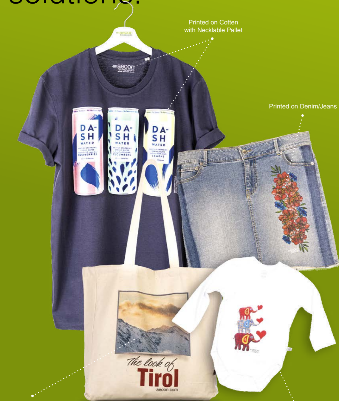
Printed on Canvas